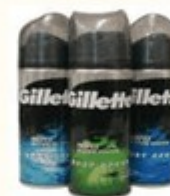
Gillette Body Spray (set of 3)