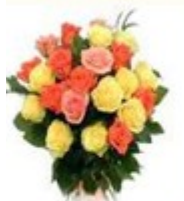
Mixed Roses Bouquet